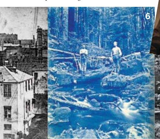
PHOTO BONANZA More than 150 kinds of photographic processes have been invented since the dawn of photography less than 200 years ago. Photo types: (1) heliograph, (2) kallitype, (3) physautotype, (4) ambrotype, (5) daguerreotype, (6) cyanotype, (7) carbon print, (8) gelatin silver, (9) collotype, and (10) autochrome.

Among the myriad photograph processes, two overarching strategies are used to get the image onto the substrate. Initially, photographers used light to directly etch images onto a substrate, usually by covering the substrate with some sort of photosensitive layer that reacts in proportion to the light being reflected off the objects getting photographed. As cellulose acetate and cellulose nitrate film were invented, photographers first captured images on film and then created prints on substrates through chemical processes, instead of directly with sunlight.