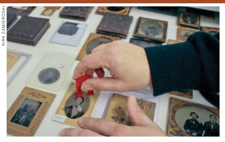
MAGNETIC AUTHENTICATION In the early 20th century, tintype photos were that era's photo booth. A photographer would set up a booth on a beach and snap your photo, with development taking only a few minutes. The image is a tin-based emulsion backed by a magnetic iron plate. Current-day counterfeiters sell fake tintypes backed with plastic instead of iron. So when you're scouring flea markets for vintage tintypes, the Getty Conservation Institute's Art Kaplan recommends you bring a little magnet with you to ensure the picture is magnetic. "It's the cheapest way to authenticate," Kaplan says.

alone, "we've analyzed 10,000 images of a variety of processes," Kaplan says. He says he's working with colleagues to organize the profusion of data into a tome that will